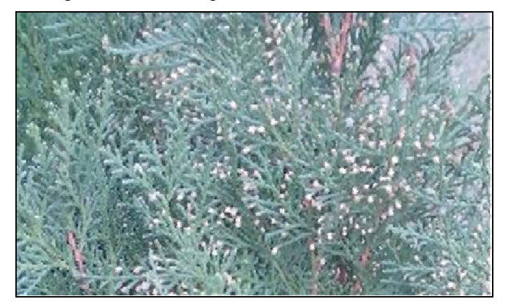
Fig. 1: Thujaorientalis leaf

distilled water at 80° temperature for 10 minutes. Heating process was done into heating mantle and after boiling all the extract filtered out from the leaves with the help of whatman no. 1 filter paper. Then the leaf extract was stored inrefrigerator with all the precaution.